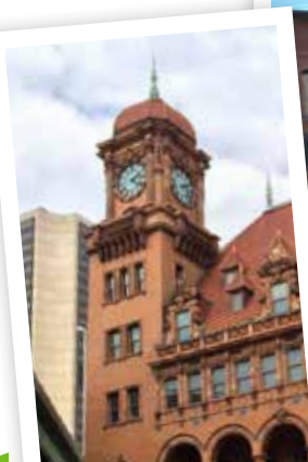
Main Street Station